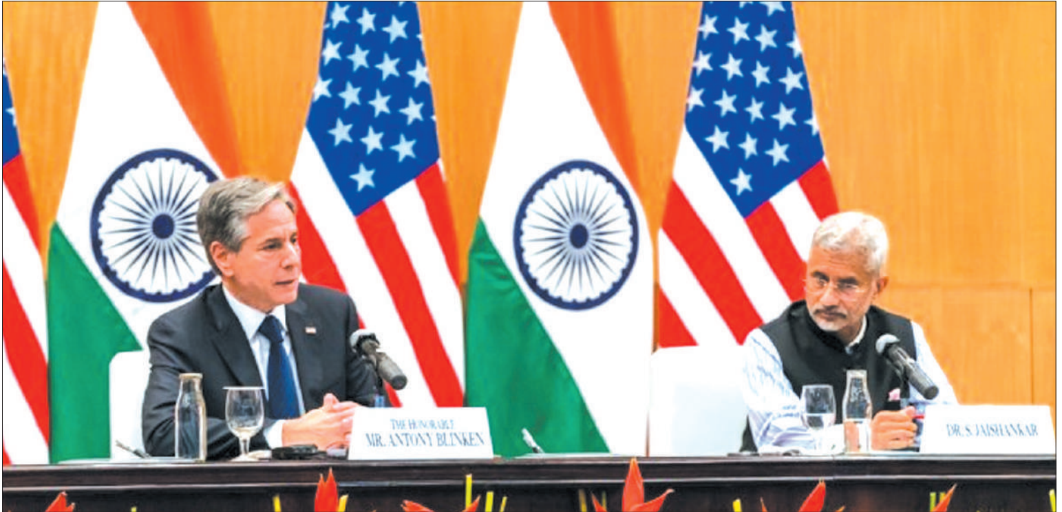
Foreign Minister Dr S Jaishankar hits back at United States on Human Rights Issue

"LOOK, PEOPLE ARE ENTITLED TO HAVE VIEWS ABOUT US. BUT WE ARE ALSO EQUALLY ENTITLED TO HAVE VIEWS ABOUT THEIR VIEWS AND ABOUT THE INTERESTS, AND THE LOBBIES AND THE VOTE BANKS WHICH DRIVE THAT. SO, WHENEVER THERE IS A DISCUSSION, I CAN TELL YOU THAT WE WILL NOT BE RETICENT ABOUT SPEAKING OUT," MR. JAISHANKAR SAID AT A PRESS BRIEFING, ADDING THAT THE HUMAN RIGHTS ISSUE WAS NOT A TOPIC OF DISCUSSION DURING THE MINISTERIAL MEETING.