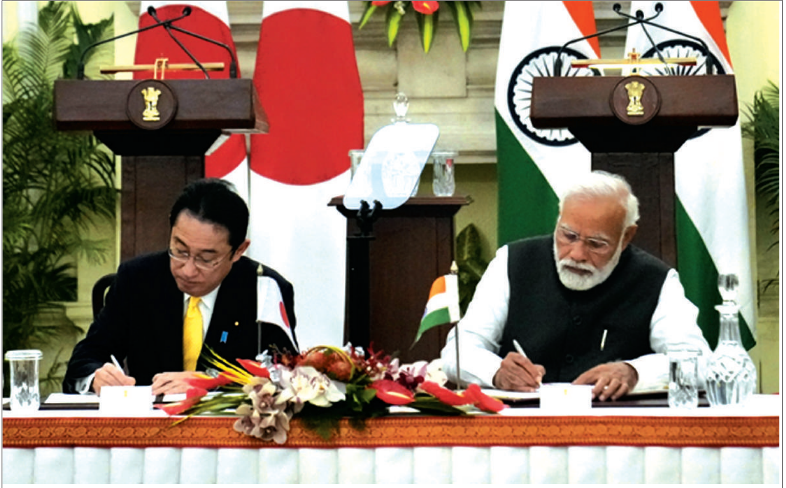
Both Prime Ministers Signing Agreement (2022) in Delhi

PRIME MINISTER KISHIDA WELCOMED THE INDO-PACIFIC OCEANS' INITIATIVE (IPOI) ANNOUNCED BY PRIME MINISTER MODI IN 2019, AND ACKNOWLEDGED THE GROWING SPACE FOR COOPERATION BETWEEN THE IPOI AND FREE AND OPEN INDO-PACIFIC (FOIP).