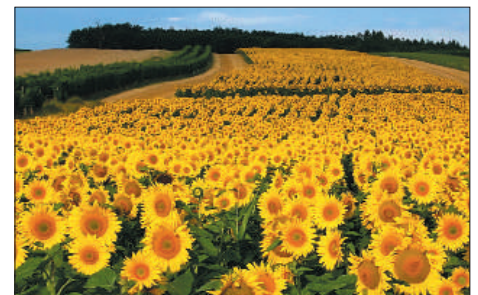
Sunflower Field Ukraine High Resolution Stock