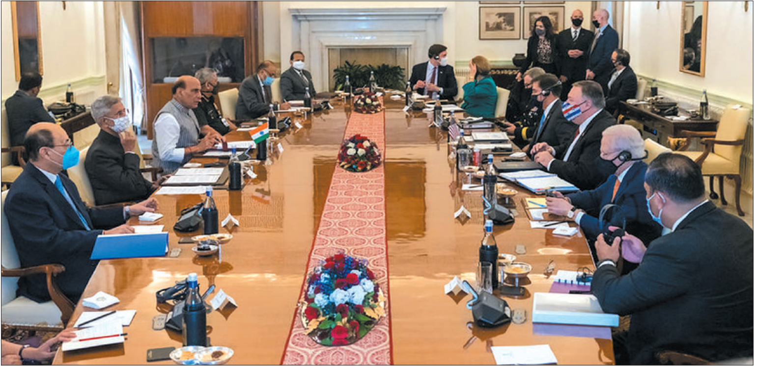
2+2 Dialogue: India, US (April 2022)

that even India also has views on other people's human rights situation, including that of the United States.