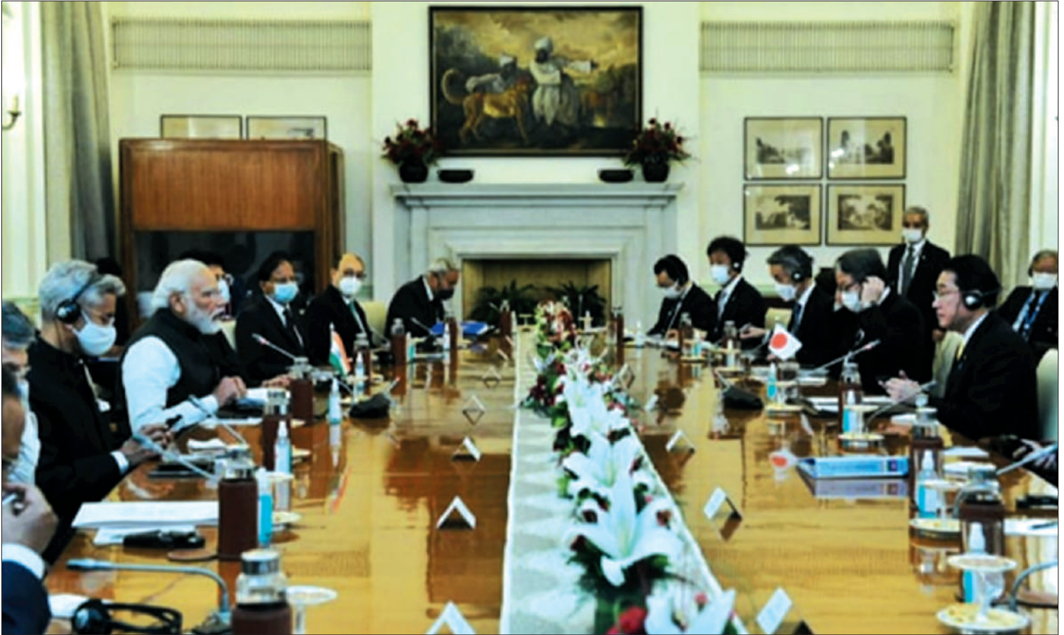
Delhi Summit meeting 2022