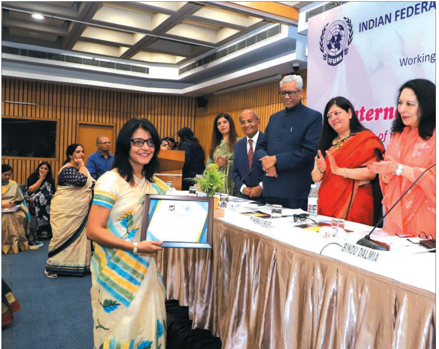
An Awardee Displaying her Award

"WE CELEBRATE WOMEN AND GIRLS EVERYWHERE. WE CELEBRATE THEIR CONTRIBUTIONS TO ENDING THE COVID-19 PANDEMIC. THEIR IDEAS, INNOVATIONS AND ACTIVISM THAT ARE CHANGING OUR WORLD FOR THE BETTER. AND THEIR LEADERSHIP ACROSS ALL WALKS OF LIFE.