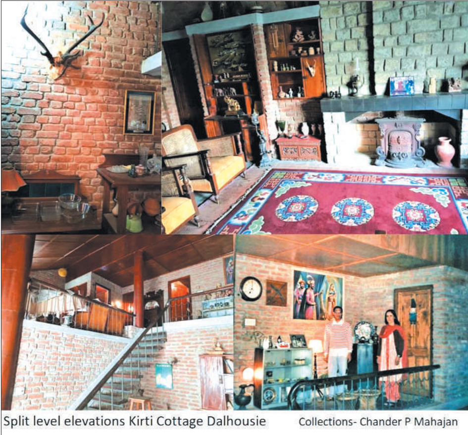
Split level elevations Kirti Cottage Dalhousie