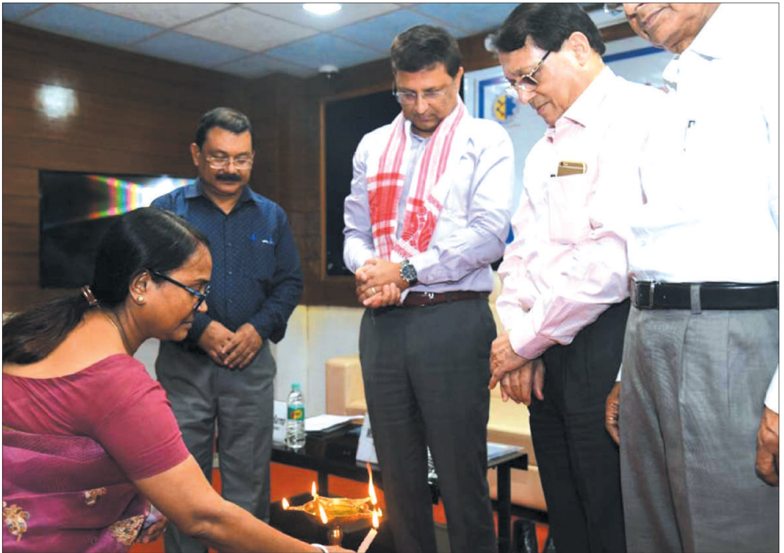
Lighting of Lamp to mark the Function