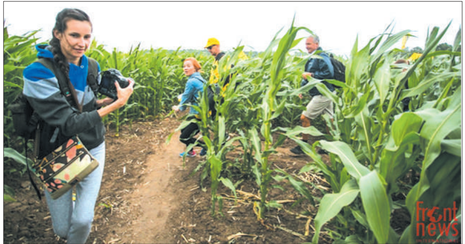
Kyiv opened a giant corn maze in the form of a map of Ukraine

India, which historically kept its huge wheat harvests at home - thanks to a government-set price - is jumping into the export market, hawking record amounts across Asia. Brazil's exports of wheat in the first three months have far surpassed those in all of last year. U.S. corn cargoes are heading to Spain for the first time in about four years. And Egypt is considering