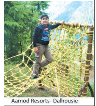
Aamod Resorts- Dalhousie

ALTHOUGH, DALHOUSIE IS NOT A POPULOUS, CONGESTED AND ENVIRONMENTALLY DETERIORATED AREA, YET IT IS APPREHENDED THAT IF LEFT TO ITSELF, THERE WILL BE A CHAOS, DESPITE THE CONSTRAINTS OF SCARCITY OF WATER, FOREST LAND IN AND AROUND THE TOWN AND ITS TERRAIN ITSELF. IT HAS BEEN PROPOSED TO INVITE AND ENCOURAGE INVESTMENT ONLY FOR HIGH QUALITY HOTELS AND RESORTS WITH PROPER FACILITIES SO THAT THE REPUTATION OF THE TOWN IS NOT SPOILED FURTHER. AT THE SAME TIME, THERE IS NEED TO PROVIDE SOME ESSENTIAL INFRASTRUCTURE FACILITIES LIKE URINALS, TOILETS, WATER TAPS.