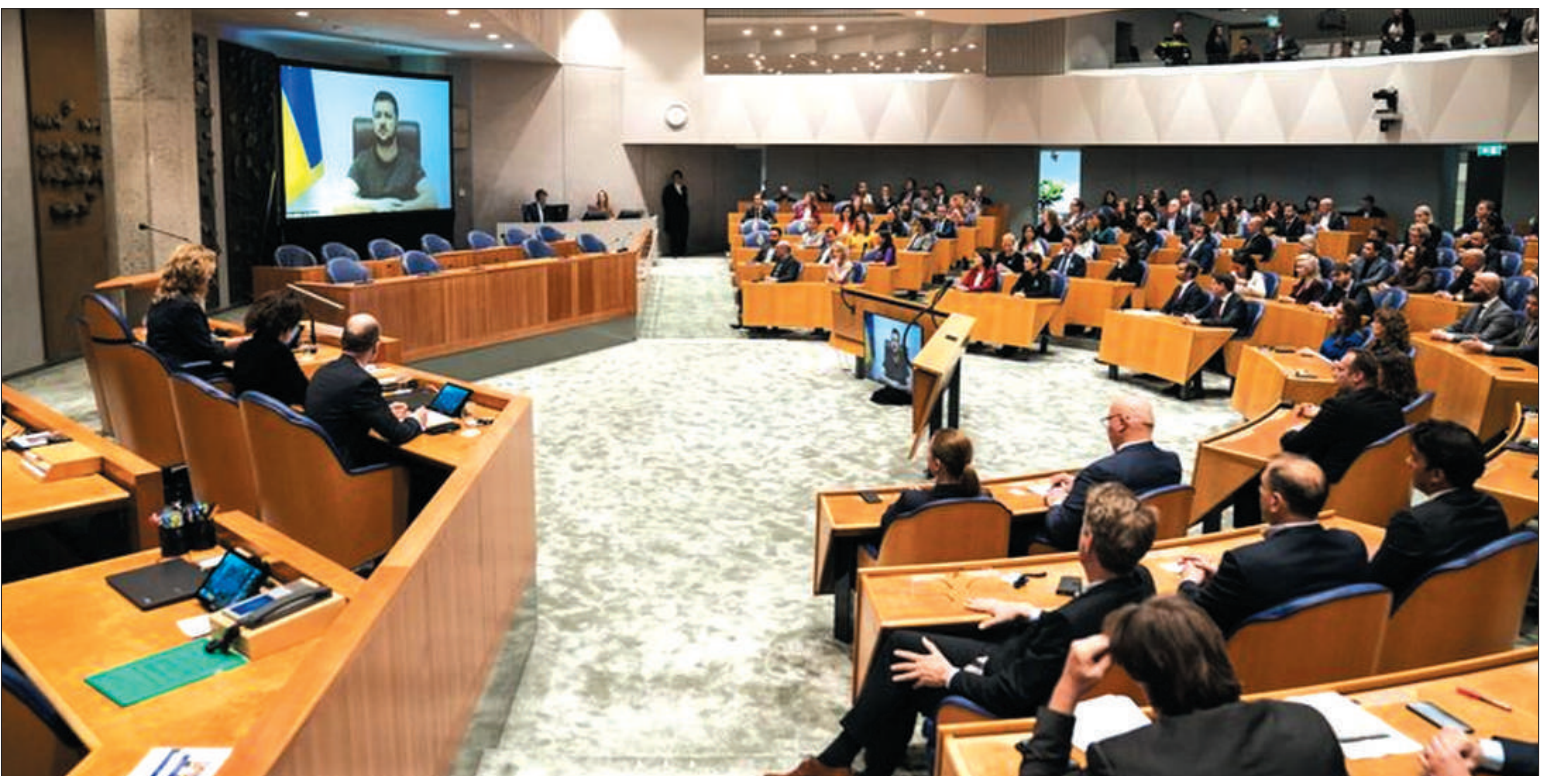
Zelenskyy addresses the Dutch House of Representatives at The Hague on March 31.

Almost one-quarter of the world's grain comes from Russia and Ukraine. Across Ukraine's farm belt, silos are stuck with 15 million tons of corn from the autumn harvest-most of which should have been hitting world markets by now. Already obstructed by supply-chain bottlenecks, skyrocketing freight rates and weather, the $120 billion global grains trade is bracing for upheavals, raising the specter of worldwide food