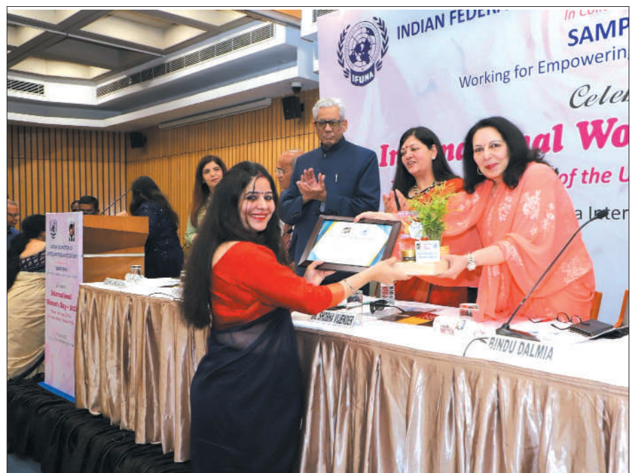
Feeling proud to receive her Award