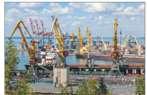
Ports, grain facilities shut down in Ukraine | World Grain